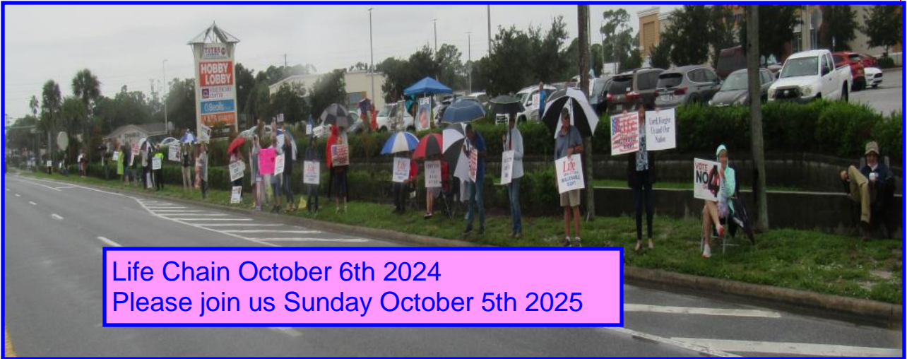
Life Chain October 6th 2024 Please join us Sunday October 5th 2025